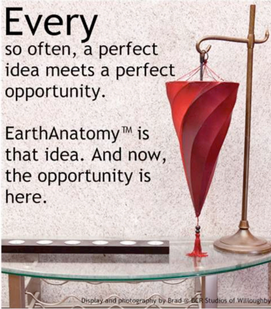
Display and photography by Brad © BCR Studios of Willoughby

EarthAnatomy™ is that idea. And now, the opportunity is here.